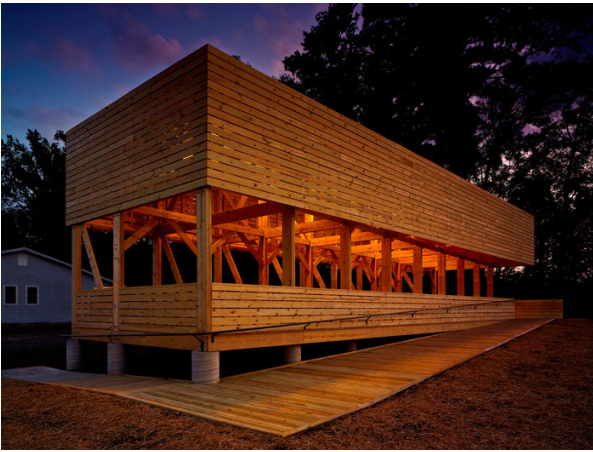
Scene from "If You Build It"