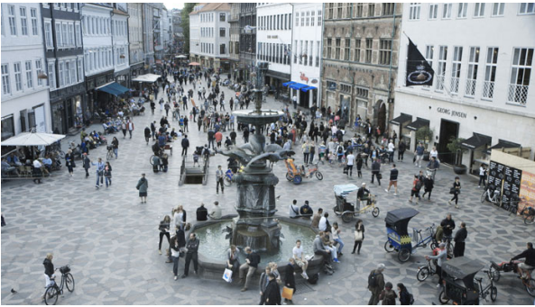
Scene from "The Human Scale"